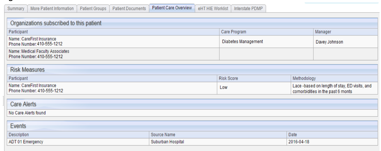
Figure 4: Patient Care Overview Tab