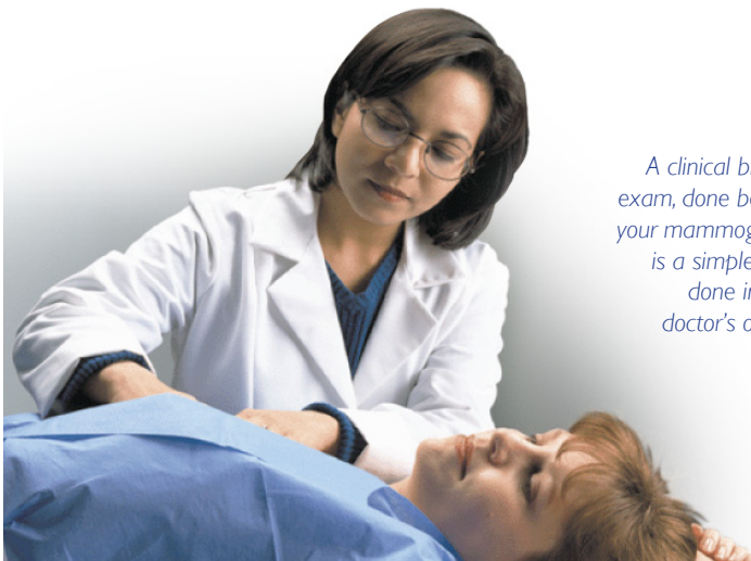
A clinical breast exam, done before your mammogram, is a simple test done in the doctor's office.

Screening saves lives. Make the clinical breast exam, mammogram, and Pap test part of your routine. Also, be sure to tell friends and family about these services too!