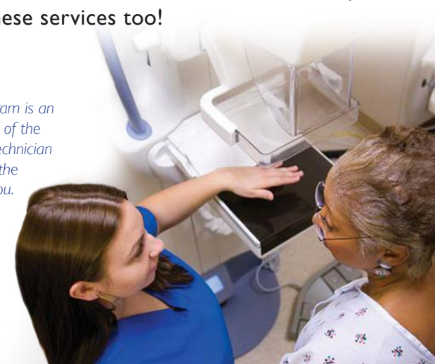
A mammogram is an x-ray picture of the breasts. A technician can explain the process to you.

“My sister has a breast exam and mammogram every year and a Pap test when her doctor orders it. But I don't have health insurance, and I don't always have the money for these tests. With the local screening program, I can take care of myself the way I know I should.”