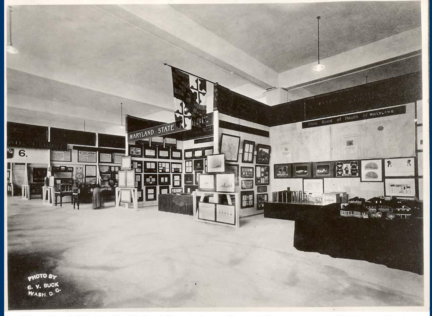
Maryland State Exhibit at the International Congress on Tuberculosis, Washington, D.C. -- September, 1908