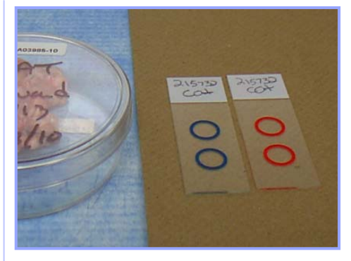
Photo 4: Preparation of impression slides for postmortem diagnosis of rabies in animals by Direct Fluorescent Antibody Testing.

IDEOR CZVD at 410-767-5649 (main); 410-767-6703 (DHMH State Public Health Veterinarian); or 410-767-6618 (CZVD Rabies Chief.) After hours, use the DHMH IDEOR Epidemiologist-On-Call pager at 410-716-8194. After securing approval, the LHD MUST contact the Laboratories