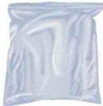
Sealed Plastic Bag