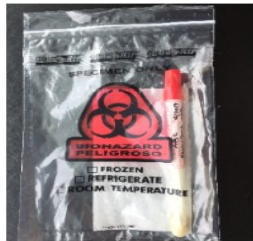
Acceptable packaging of swab in one bag