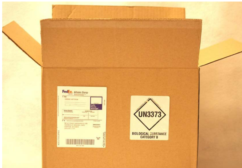
University of New Hampshire https://nhvdl.unh.edu/sending-specimens