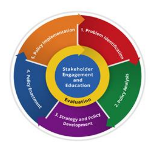
Exhibit 2. Centers for Disease Control Policy Development Framework

advocates, and individuals and families. These steps may be accelerated when the need for policy is urgent, however, the integrity of each step should remain intact, enabling clarity of purpose for the policy, as well as input and buy-in from all system players. Essentially, this investment in structure intersects with the knowledge translation and management framework, effectively arming all key partners with the information necessary to accurately and effectively convey and reinforce DDA policies and procedures.