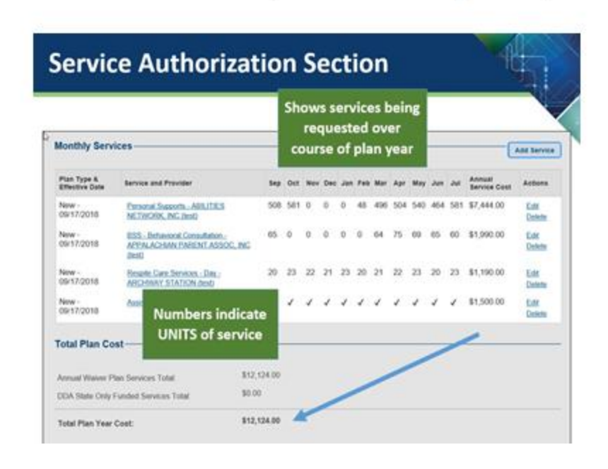
Exhibit 5. LTSSMaryland Training Example

The person-centered planning modules (initial, revisions and annual) within LTSSMaryland are reportedly very complex, contributing to a redirection of focus away from the person and toward an emphasis on data entry. It was noted the PCP workgroup exemplifies a good person-centered format and there is hope that the DDA impact study on providers' use of LTSSMaryland will identify known barriers, effect positive change, and result in common language and solutions within the LTSSMaryland system. It also was noted there is a system and email disconnect regarding how information is clarified in person-centered plans through alerts. DDA has worked to increase the availability of PCP reporting in LTSSMaryland. For instance, the PCP workflow history report includes a summary of person-centered plans in the creation phase, average rates of completion of CCS level and region level tasks, and percentage of person-centered plans with either one, two, or more clarification requests. The capabilities of the charts on the dashboard can be filtered in multiple ways, such as create date month of the person-centered plan by region and by CCS agency. The dashboard also includes a backup that displays all of the information in a static, tabular manner. It was noted that for statistics regarding the "life cycle" of person-centered plans, only annual, initial, and revised plans that have already been