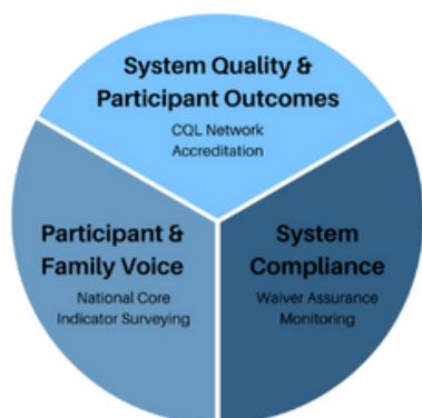
Evaluating Progress Towards Person-Centered Excellence