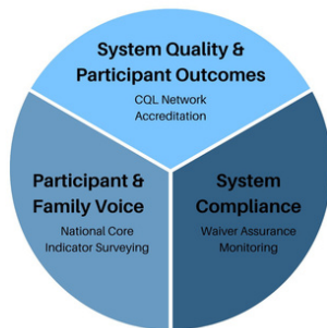
Evaluating Progress Towards Person-Centered Excellence

Evaluating Person-Centered Excellence within the DDA system is being conducted through CQL Basic Assurance Reviews and Personal Outcome Measures, National Core Indicator Participant and Family surveys and through system compliance reviews. Data from these evaluations can provide information on the degree to which,