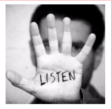
Peer Specialist Winter Webinar Series Recordings

This is a short video showcasing common challenges faced by culturally diverse youth in their journey towards wellness recovery. We have developed this companion toolkit to help you plan a video talk circle event. These tools can support individuals, agencies, youth advocates, and partners from all cultural backgrounds who seek to promote youth wellness and leadership. In this documentary we highlight key resources, programs, and strategies that have successfully worked to support the wellness journey of youth. Youth United For Change