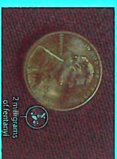
Photo illustration of 2 milligrams of fentanyl. A lethal dose in most people.

In 2019, Kent Goes Purple is focusing on the fentanyl and heroin epidemic in Kent County.