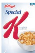
KELLOGG'S Special K