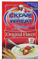
B&G FOODS Cream of Wheat • Instant • 1 Minute • 2 1/2 Minute