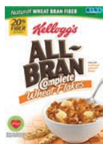
KELLOGG'S All Bran Complete Wheat Flakes