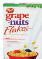
POST Grape-Nuts Flakes