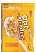
MALT-O-MEAL Oat Blenders Honey