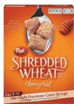
POST Shredded Wheat Honey Nut