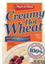
MALT-O-MEAL Creamy Hot Wheat