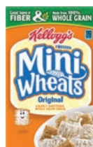
KELLOGG'S Frosted Mini Wheats Bite size