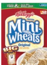
KELLOGG'S Frosted Mini Wheats Big Bites