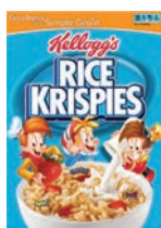
KELLOGG'S Rice Krispies