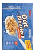
MALT-O-MEAL Oat Blenders Honey & Almonds