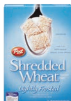
POST Shredded Wheat Lightly Frosted