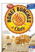
POST Honey Bunches of Oats • Vanilla Bunches • Honey Roasted • Almond • Cinnamon Bunches