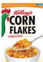
KELLOGG'S Corn Flakes