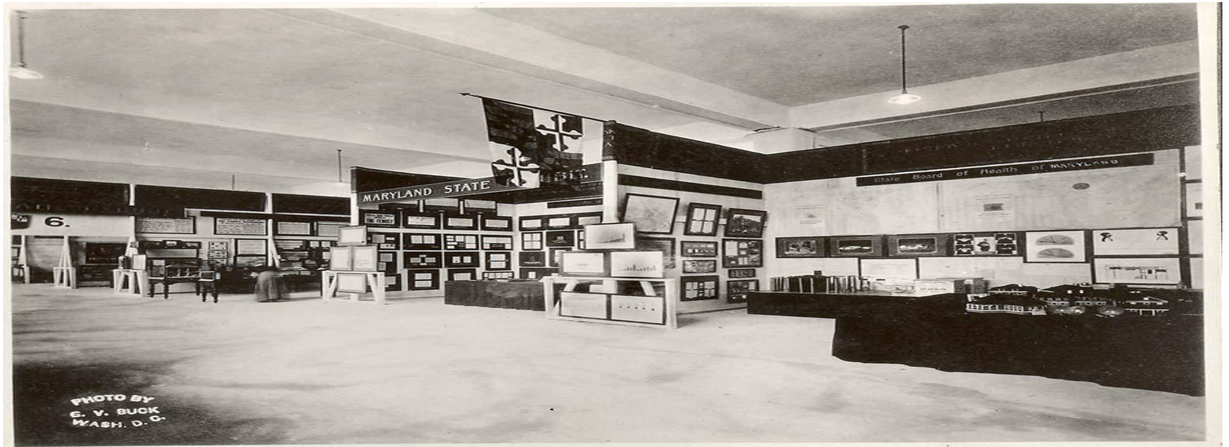
Maryland State Exhibit at the International Congress on Tuberculosis, Washington, D.C. -- September, 1908