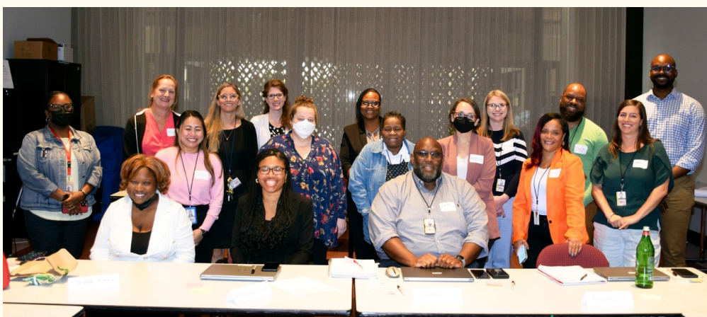
Photo: August 2023 PHS QI Introductory Training

The QI Council implements continuous improvement in PHS by providing guidance, support, and an expanded network for QI initiatives. Members gain valuable skills through professional development training and involvement in QI projects, aimed at improving systems, processes, and outcomes and promoting innovation and collaboration.