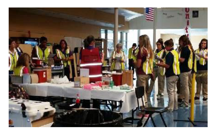
Chesapeake College Nursing Program student volunteers learn about mass vaccinations.

On October 16, 2015, Queen Anne's County Department of Health (QACDH) held a mass immunization flu clinic and exercise. Multiple community partners, including Maryland Responds, health department staff, Chesapeake College student nurses, local EMS and county law enforcement helped lead this event to its success. QACDH received a great response from Maryland Responders and Mid-Shore Mental Health. The collaboration of partners added to the success of this event while helping the community become more familiar with what it might be like to a attend a mass treatment center if one is ever needed.