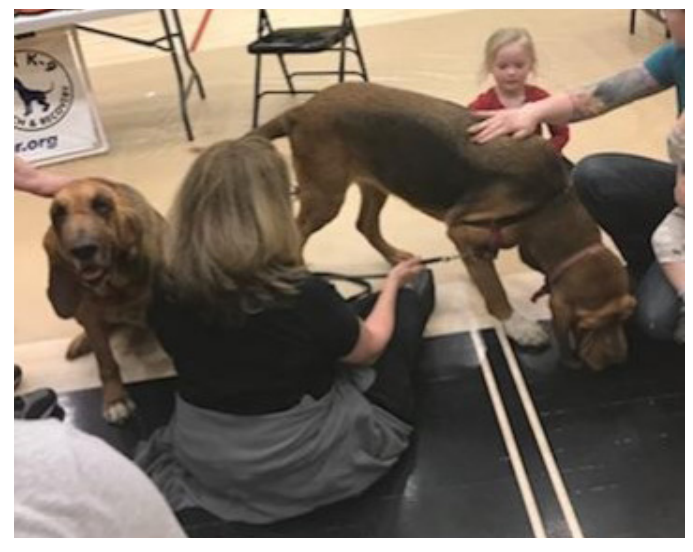
Image: Dogs Edgar and Milie from Bay K-9 Search and Recovery, an all-volunteer non-profit search team, playing with participates at the fair.