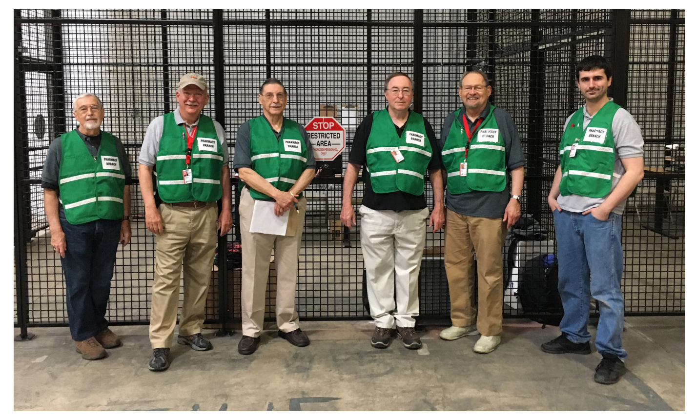
Image: Maryland Responders from the Board of Pharmacy Emergency Preparedness Task Force work to ensure medical supplies are correctly stored and labeled at the RSS warehouse.

Free trainings are available through the CDC's online learning management system (CDC TRAIN). Visit <a href="https://www.cdc.gov/phpr/stockpile/training.htm">https://www.cdc.gov/phpr/stockpile/training.htm</a> to see what online courses are available and for links to create an account and register for CDC TRAIN.