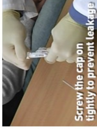
Screw the cap on tightly to prevent leakage