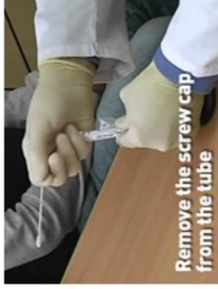
Remove the screw cap from the tube