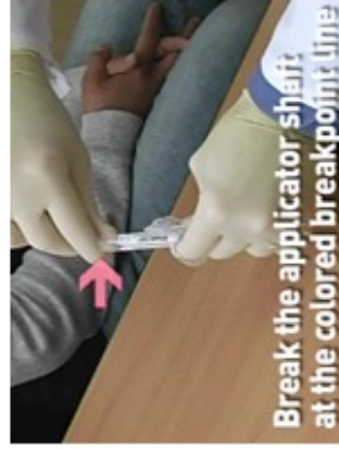
Break the applicator sheath at the colored breakpoint line