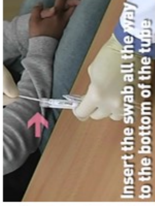
Insert the swab all the way to the bottom of the tube