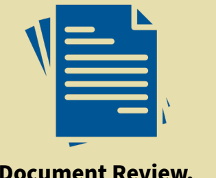
Document Review, Collection, and Submission

All documentation submitted 1 week prior to onsite review!