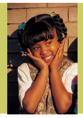
State Board for the Certificationof Residential Child Care Program Administrators